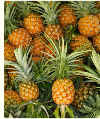
ORGANIC PINEAPPLE TOUR