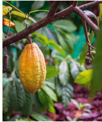
DON JUAN: CHOCOLATE, SUGAR CANE AND COFFEE TOUR