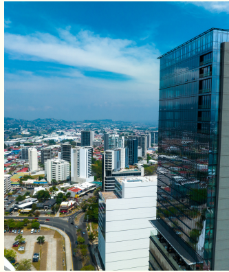
SAN JOSE CITY TOUR