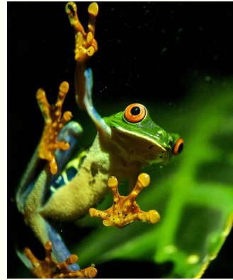
MONTEVERDE CLOUD FOREST BIOLOGICAL RESERVE