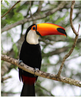
TOUCAN RESCUE RANCH