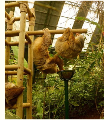
SELVATURA – SLOTH SANCTUARY