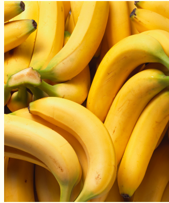
BANANA PLANTATION TOUR