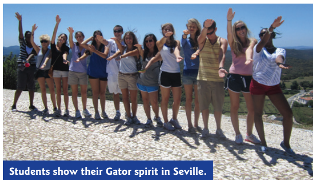
Students show their Gator spirit in Seville.