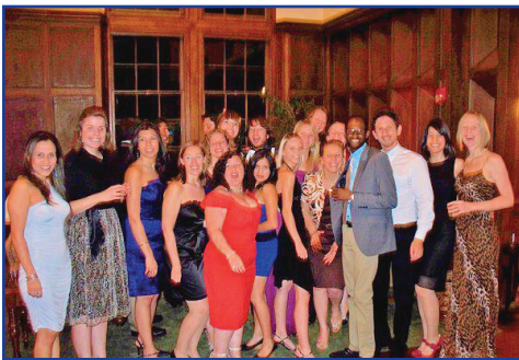
OEGE enjoying gala dinner at the Keene Center