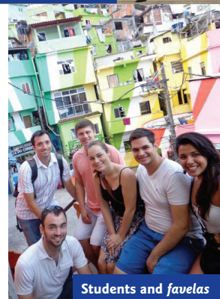
Students and favelas

ranza,” en la sección de la pescadería, presencié un diálogo entre los estudiantes y un pescadero: “¿Es ‘el mar’? O, ¿‘la mar’?” dijeron los chicos, tímidamente. El hombre respondió con una pregunta: “¿De qué habláis?” Los chicos repitieron: “La palabra ‘mar’ ¿es femenina o masculina?” Y el hombre: “Bueno, es que se siente, ¿no? ¡Es femenina! ¡Es la mar, claro! ¡No lo sentís? La mar, la mar, la mar ... es femenina. ¡Se siente!” Todo esto mientras subía sus dos manos enroscándolas lentamente frente a su vientre como indicando que le salía de las entrañas. Fue tan intenso que nos miramos, luego a él, y le dijimos: “Sí, claro. Se siente. ¡Es femenina!” Nos había convencido. Luego andaban los chicos repitiendo: “Es la mar.” [Discutimos el asunto del cambio de género en clase. La experiencia les fascinó.] Así, ¡no hay quien no aprenda la lengua!