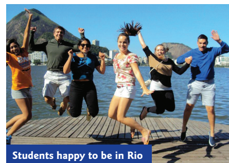
Students happy to be in Rio