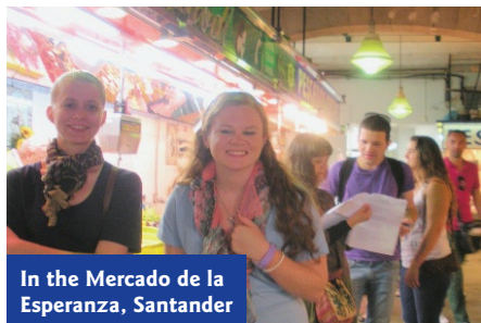
In the Mercado de la Esperanza, Santander

The summer program in Rio de Janeiro, partnered with Georgetown University and IBEU—Instituto Brasil Estados Unidos, continues to attract students. Summer 2012 was yet another successful experience. In addition to a faithful cadre of Gators, including students from Spanish and Portuguese Studies, twenty-eight students from twelve different universities participated. Students took language classes in the morning and explored culture in the afternoon sessions,